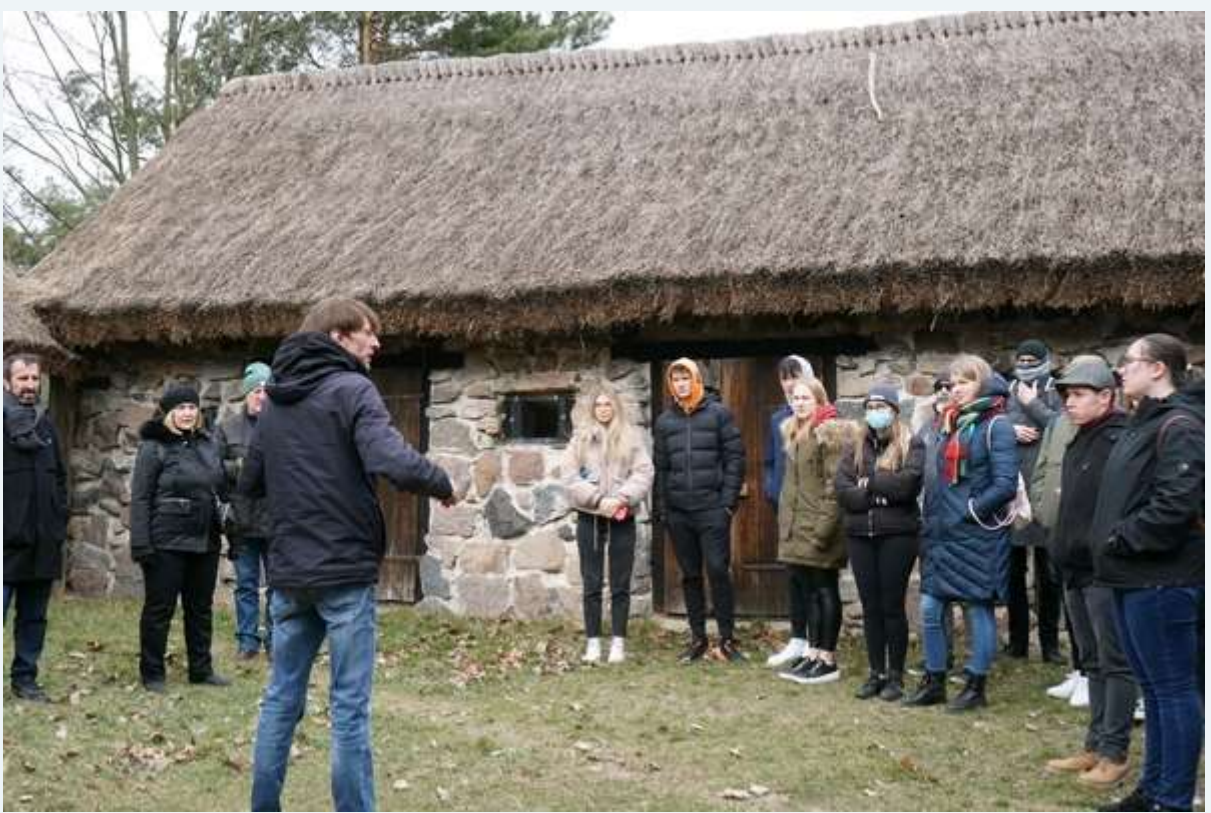
4. A guided walk around Łowicz