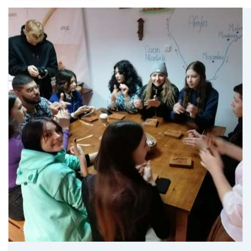
3. A visit to Copernicus House